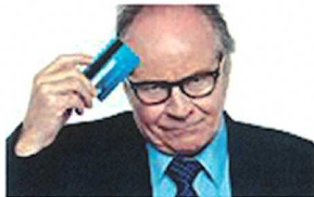
Experts Reveal Top 10 Cash Back Credit Cards Next Advisor