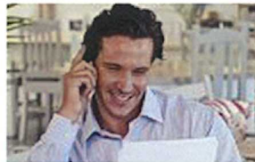
The Advantages Of Outsourcing U.S. Bank Connect