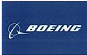
St. Louis fails to make the short list for Boeing's 777X