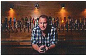
Two local bars make top beer bars list