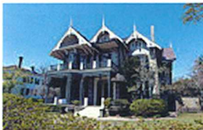
Sandra Bullock's New Orleans Mansion - How Does It Compare to Oth... Lonny