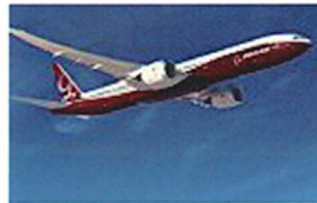
St. Louis has 'no chance' to land work on Boeing 777X, analyst says